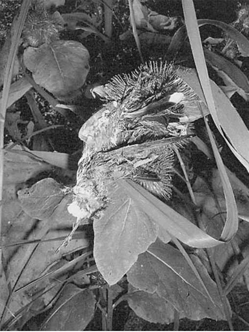
FIGURE 2. Ruby-throated Hummingbird entangled in burdock found 14 September 2002, Delta Marsh.

The large number of hummingbird entanglements in burdock over a short period in August 1985 seems unusual. Burdock apparently has increased in abundance on the ridge forest (Kenkel and Graham 1994) since our studies began at Delta in 1973. This suggests that the frequency of entanglement should have increased or at least remained constant. However, search effort has varied widely since 1985 and migration rates and weather patterns affecting bird movements through the ridge forest vary from year to year. Hence, it is difficult to assess from occasional records the overall effect of burdock at Delta Marsh on migrating birds. Nevertheless, the growing number of reports of burdock-related deaths in birds (e.g., McNicholl 1994; Raloff 1998; Underwood and Underwood 2001) suggests that this type of mortality may be more important than originally believed, particularly at places like Delta Marsh, and King's Park in Winnipeg (Underwood and Underwood 2001), where burdock and large numbers of migrating birds are concentrated. Further study of the interaction between birds and burdock and the possibly fatal consequences for birds should result in a better understanding of the effects of this exotic plant species on bird populations.