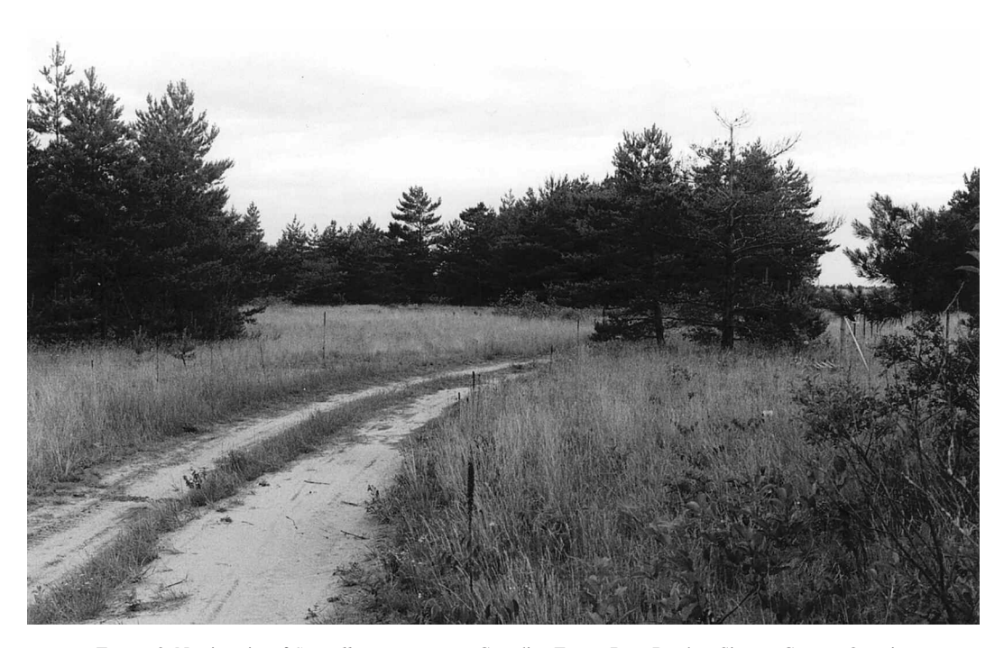
FIGURE 2. Nesting site of Stictiella emarginata at Canadian Forces Base Borden, Simcoe County, Ontario.

continuous pine plains, and periodic fires characterized the area. The coarse loamy sand coupled with ground and crown fires supported large Red Pine and White Pine [ Pinus strobus L.] forests, savanna and barrens (Varga and Schmelefske 1992). Military activity on the Camp Borden Sand Plain in the 20<sup>th</sup> century maintained the savanna, barrens and sandy openings (Kurczewski 2000).