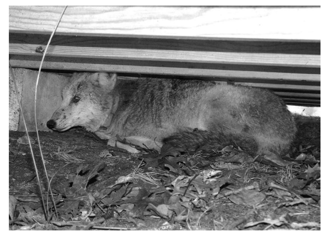
FIGURE 3. Coyote #9804 sitting under a shed (January 2005) in a residential area at the southeastern portion of her former range, in West Yarmouth, Cape Cod, Massachusetts.

use areas, although the high number of unsuccessful finds for her in 2006 also suggests that she explored surrounding areas potentially inhabited by other (uncollared) packs. Third, Red Foxes were seen in close proximity to the Coyote (< 200 m) much more frequently during her nomadic phase(s) than during her territorial phase (i.e., 1998 - 2004). Our data indicated that she lived at the periphery of resident Coyote packs' ranges, and in more clustered areas, likely a tactic to avoid encountering resident Coyotes (Figure 1). Larger canids are dominant over smaller ones, (e.g., Wolves over Coyotes and Coyotes over Foxes) (Major and Sherburne 1987; Harrison et al. 1989; Johnson et al. 1996) and therefore the observations of foxes in close proximity to the Coyote suggests that she may have been perceived as less of a threat by foxes during her nomadic phase, she may have been less aggressive to the foxes, and/or that both the Coyote and foxes were spending the majority of their time in areas of low use by resident Coyote packs.