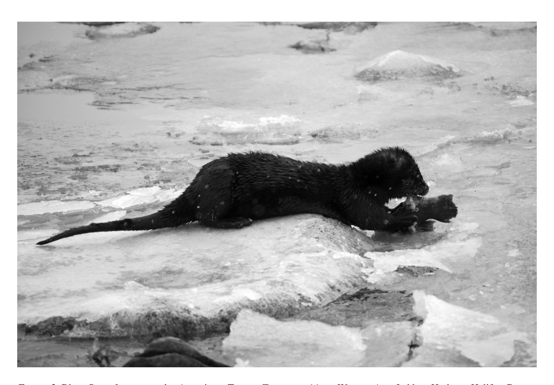
FIGURE 3. River Otter, Lontra candensis , eating a Tautog, Tautoga onitis , at Western Arm Jeddore Harbour, Halifax County, Nova Scotia, on 17 February 2008.

$0.35 in the market, both taken on 21 May 1903 in Petpeswick Inlet, Halifax County, Nova Scotia. The length to base of caudal fin of the one purchased was 13 ½ inches (33.2 cm), and the second one was about 19 inches (48.2 cm) long. Piers stated "The woman who had them called them Black Bass".