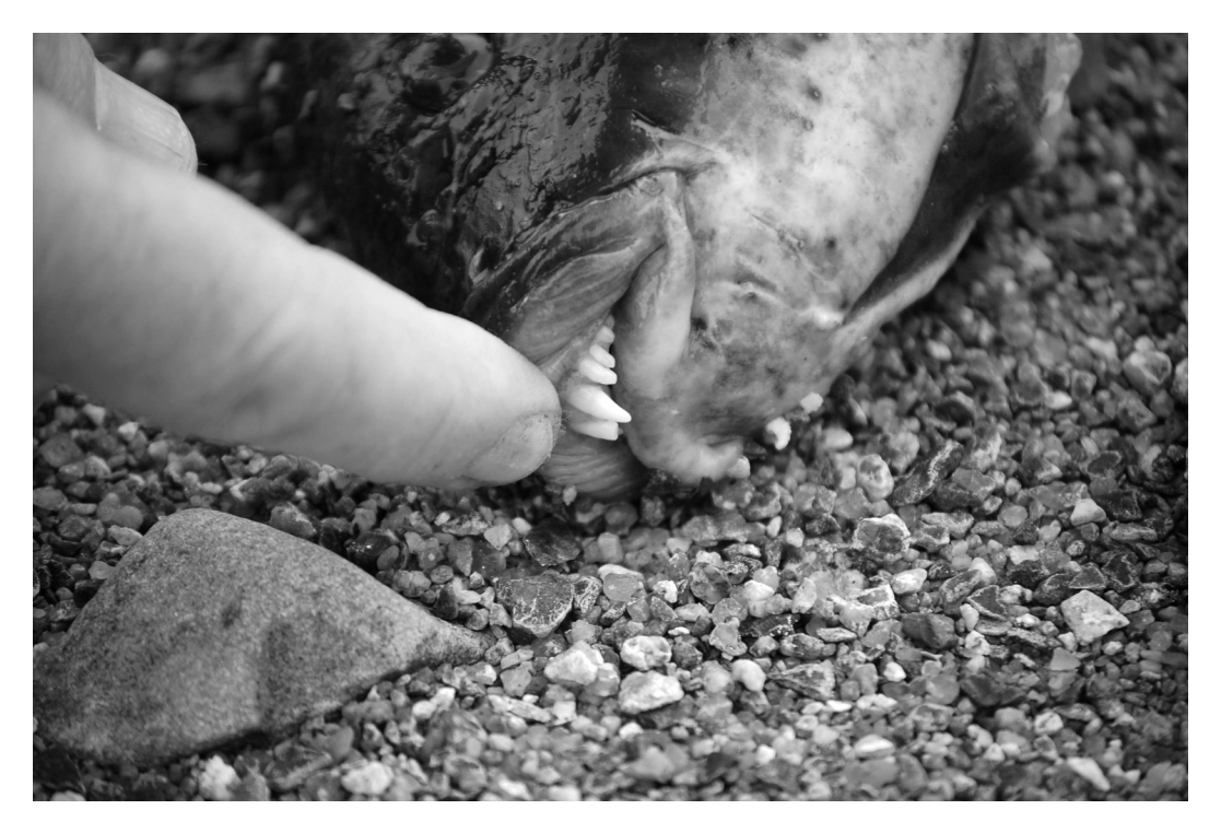
FIGURE 2. Head of Tautog, Tautoga onitis , from Western Arm Jeddore Harbour, Halifax County, Nova Scotia, 17 February 2008, showing blunt conical teeth (NSM.88251).