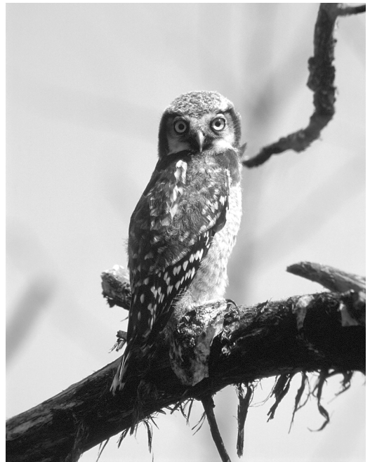
FIGURE 4. This large fledgling Northern Hawk Owl was photographed in Wilkie Township, near Iroquois Falls, on 23 June 2005.