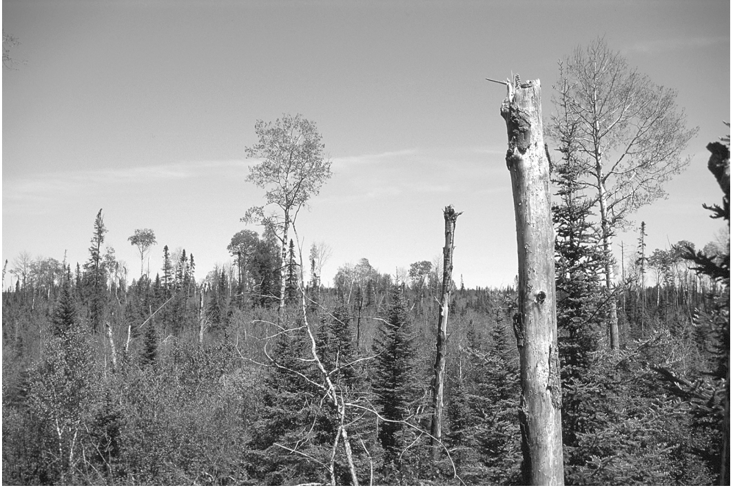
FIGURE 2. Nesting habitat and nest site of Northern Hawk Owl, Surnia ulula caparoch , in Cochrane District of Ontario. Incubating owl could be seen at the top of the snag in the foreground (nest Number 1). Photo by Michael Patrikeev in 30 May 2001.