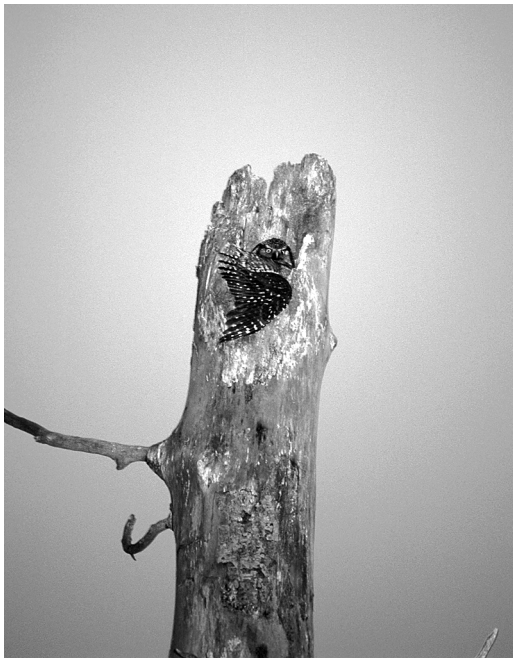
FIGURE 3. The second nest found in Crawford Township was in a cavity open on one side. 30 May 2001.