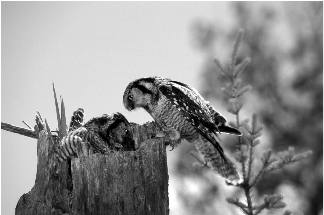
FIGURE 5. Pair of Northern Hawk Owls at nest. The male had just delivered a carcass of a Meadow Vole, and the female (on the left) is holding the vole over the young's heads allowing them to tear at the carcass (nest Number 1).