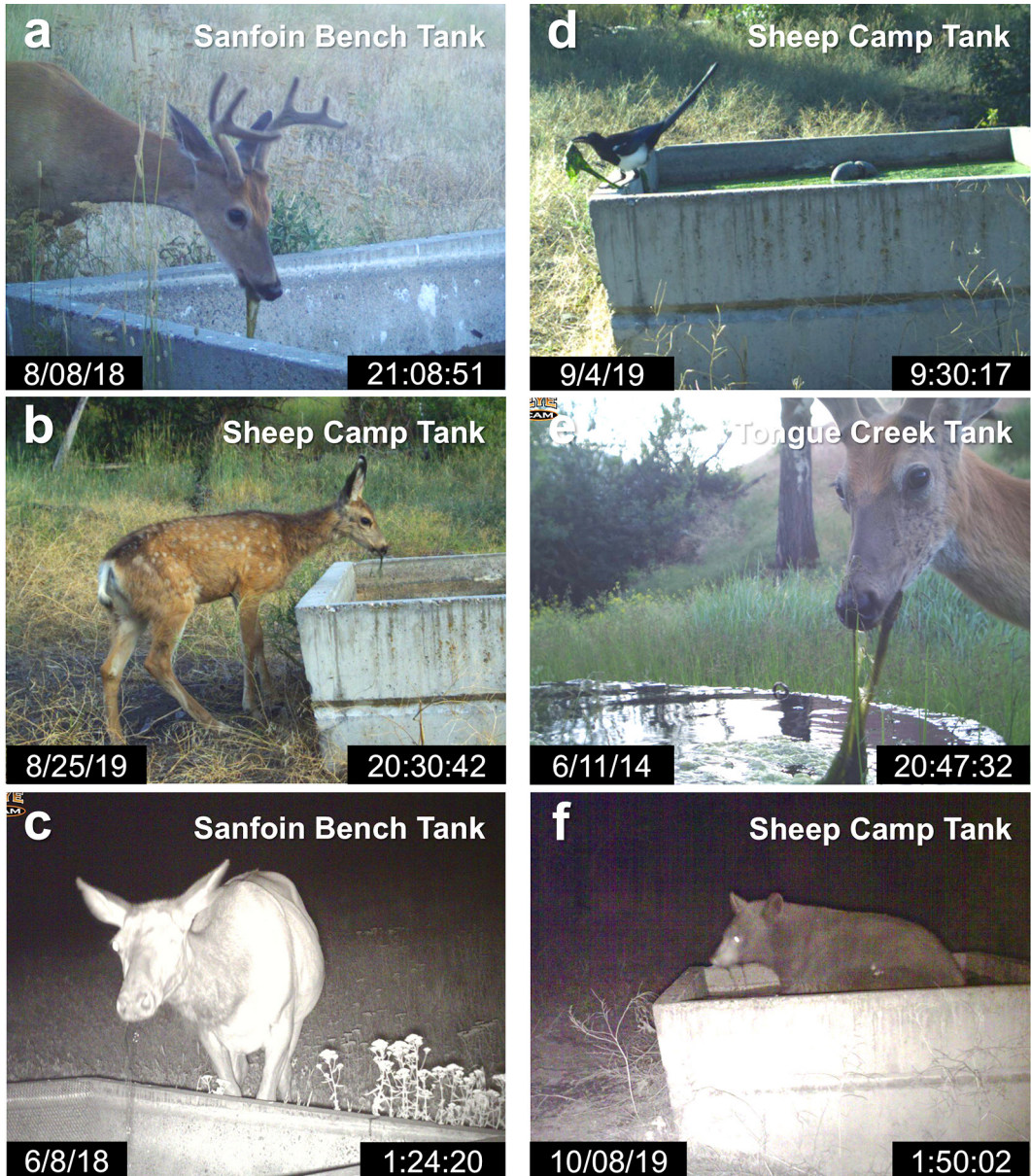
FIGURE 5. Photo-captures of wild animals foraging on algae in livestock tanks on MPG Ranch in western Montana, USA.

2021). Thus, it is possible that Bear M2 foraged on algae for nutritional benefit.