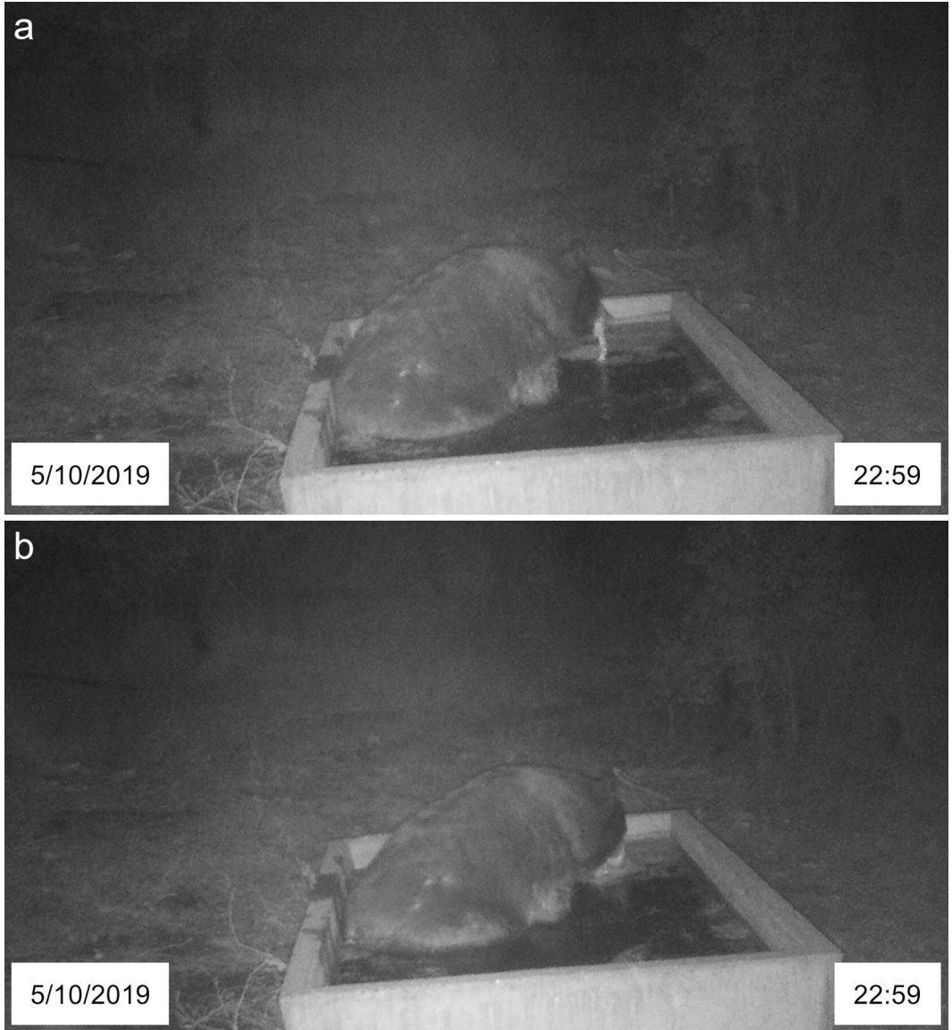
FIGURE 4. Frames from a video-capture (Video S3) of adult male American Black Bear ( Ursus americanus ) M2 foraging on algae on 5 October 2019, in a livestock tank on MPG Ranch in western Montana, USA.

al. 1995; Boedeker et al. 2010) consisting of >183 species (Munir et al. 2019; Michalak and Messyasz 2021). Seasonal blooms of Cladophora species can create detrimental environmental and recreational issues in freshwater bodies (Messyasz et al. 2015; Nutautaitė et al. 2021; Michalak and Messyasz 2021), but Cladophora species can also benefit wildlife because they contain biologically active ingredients (Nutautaitė et al. 2021). For example, the commonly occurring Cladophora glomerata contains