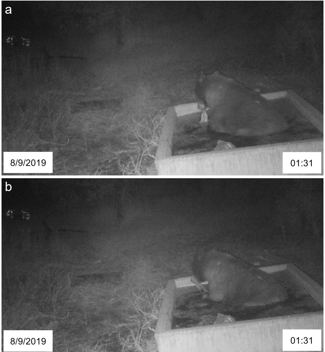
FIGURE 2. Frames from a video-capture (Video S1) of adult male American Black Bear ( Ursus americanus ) M2 foraging on algae on 8 September 2019, in a livestock tank on MPG Ranch in western Montana, USA.

documented several wildlife species foraging on algae in livestock tanks (Figure 5), including White-tailed Deer, Mule Deer, Elk, and Black-billed Magpie ( Pica hudsonia ). At 1:50 on 8 October 2019, one Buckeye image documented adult female Bear F2 at the Sheep Camp livestock tank with material that appeared to be algae dangling from her mouth (Figure 5f). The video camera that was also aimed at the Sheep Camp livestock tank failed to video-capture this algae foraging event.