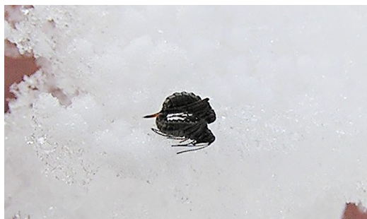
FIGURE 1. Mating pair of California Snow Scorpionfly ( Boreus californicus ) near Polebridge Ranger Station, Glacier National Park, Flathead County, Montana, 13 February 2013. Male (below) grasping female to his back with modified wings; individuals are ~4.0 mm in length.

Boreus californicus was widespread, both in habitat and elevation, occurring in mixed grassland and lower-elevation mixed conifer forest as low as 991 m asl but also subalpine mixed conifer