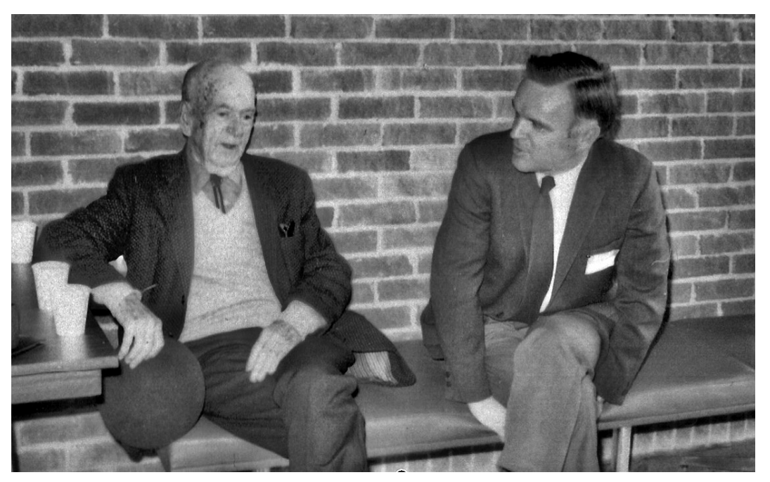
FIGURE 11. The interpreter: Yorke in conversation with Freeman Tilden (left), guru of American heritage interpretation, Wye Marsh Nature Centre, Midland, Ontario, 1970.

seum-going public attended the openings of several major exhibits including the First Peoples gallery and the natural history gallery, Living Land, Living Sea. Himself a writer, Yorke made sure the museum's publication program flourished. He also stressed the importance of travelling exhibitions; between 1976 and 1982, an average of six museum exhibits visited 15 venues annually (Roy 2018).