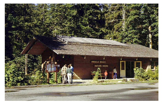
FIGURE 7. Nature House, Miracle Beach Provincial Park, Black Creek, British Columbia, 1960s. Photo: courtesy of the Royal BC Museum (BC Archives item 1-07042).