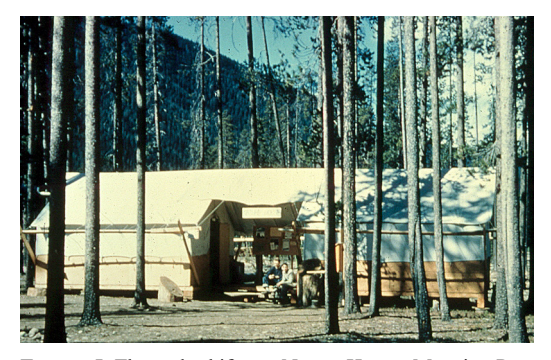
FIGURE 5. The makeshift tent Nature House, Manning Provincial Park, British Columbia.

pretive signs, nature trails, and naturalist talks to most regions of the province.