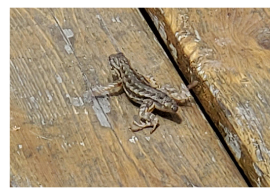
FIGURE 1. The single juvenile Western Fence Lizard ( Sceloporus occidentalis ) found in the Cloverdale area of Surrey, British Columbia, Canada, 6 June 2020. Total length estimated at 50 mm.

A single juvenile S. occidentalis (Figure 1) was photographed by R.F. on 6 June 2020, at 1150, 49.103868°N, 122.719329°W, in the Cloverdale area