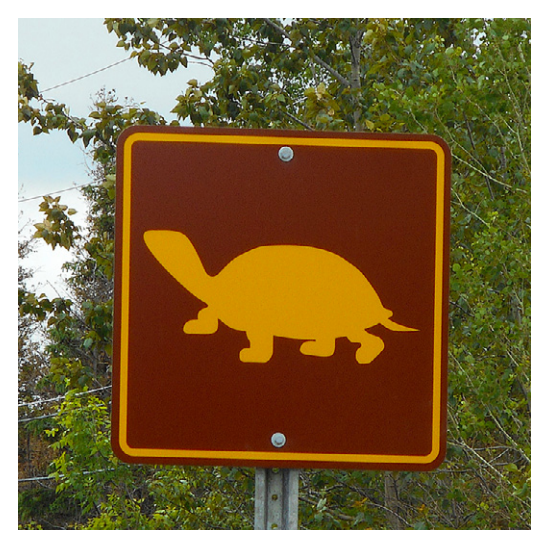
FIGURE 1. Example of turtle sign installed by the Ministry of Transportation along provincial highway 15 in eastern Ontario in May 2018.

annual average daily traffic of 4950 to 9400 vehicles (Ministry of Transportation 2019).