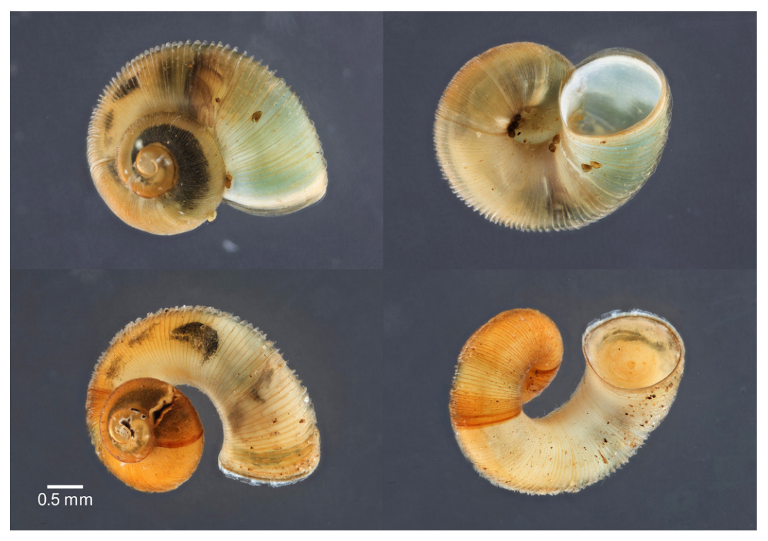
FIGURE 2. Dorsal and ventral views of Valvata lewisi (top) and Valvata lewisi var. ontariensis (bottom).

revealed the co-occurrence of V. lewisi var. ontariensis and V. lewisi ( sens. str. ) at sites W390, W633, and OGW-732-1. Voucher specimens have been preserved in 80% ethanol and deposited in the invertebrate zoology collection at the Royal Alberta Museum in Edmonton, Alberta, Canada (ABMI.A.91, ABMI. A.5396, ABMI.A.11900, ABMI.A.15382, ABMI.A. 18222, and ABMI.A.30673).