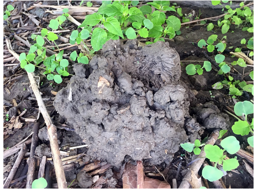
FIGURE 3. Fresh mud at the opening of a crayfish burrow in Vince Marcotte Park, Windsor, Ontario, Canada (42.245°N, 83.071°W), 15 May 2018.

As species, such as Paintedhand Mudbug, are new-