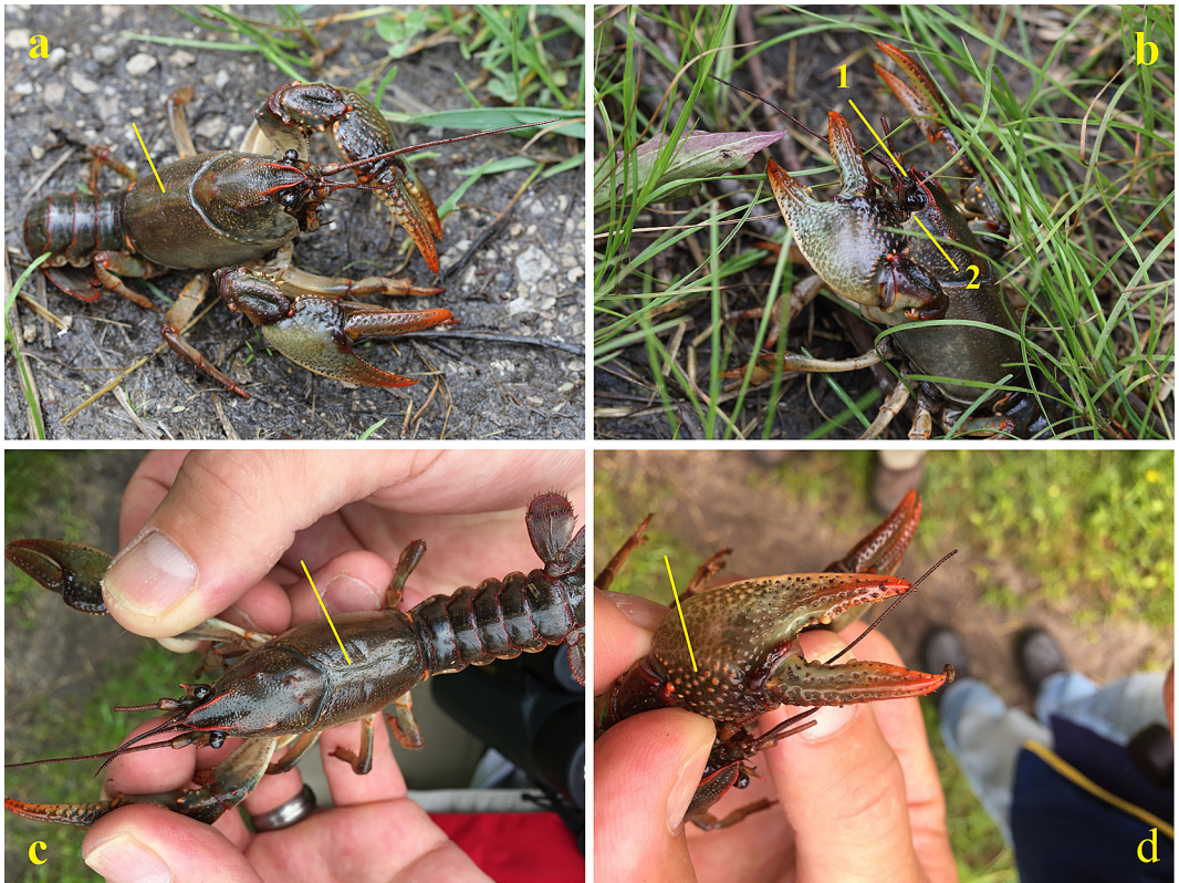
FIGURE 1. Paintedhand Mudbug ( Lacunicambarus polychromatus ) recorded on 26 May 2017 at Ojibway Prairie Provincial Nature Reserve, Windsor, Ontario. Distinguishing characteristics of the species are indicated by lines: closed areola (a, c); deflected rostrum (b1); suborbital angle (b2); dorsal surface of the palm of the chela with mesial quarter to third studded with tubercles not forming distinct rows (d).

The surveys on 15 May 2018 at Ojibway Prairie Provincial Nature Reserve were successful in confirming the presence of L. polychromatus . At this location, burrows were found along a shallow ditch running along the northern edge of the nature reserve not far from where the specimen was located in 2017. The nature reserve is 105 ha in size and includes a