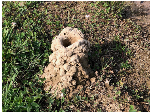
FIGURE 4. A Paintedhand Mudbug ( Lacunicambarus polychromatus ) chimney in Muhlenberg County, Kentucky, USA (37.313°N, 87.201°W), 11 June 2018.

ly discovered in Ontario, they are added to the provincial species list maintained by the Natural Heritage Information Centre (NHIC), Ontario Ministry of Natural Resources and Forestry, and are assigned a conservation status rank following methods developed by NatureServe (Faber-Langendoen et al. 2012; Master et al. 2012). Paintedhand Mudbug has been assigned a rank of S1S2 (critically imperilled to imperilled). The NHIC typically compiles observations of species with a conservation status rank of S3 (vulnerable) or higher. These observations then inform areas of conservation value (element occurrences) and are added to the provincial record where they are available to inform conservation, land-use, and natural resources management planning, policy, and legislation.