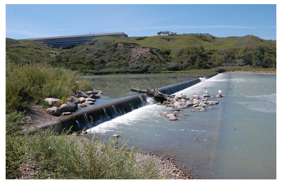
FIGURE 4. The Lethbridge weir across the Oldman River in late summer when flows are low and the recirculation hazard is reduced. American White Pelicans ( Pelecanus erythrorhynchos ) are common, feeding on fish that are blocked by the weir from upstream passage.

Following these observations, we suspect that the hazard to waterfowl varies considerably across weirs and with different river flows. A small weir on a small stream would produce a modest hydraulic recirculation zone that would be less capable of stopping and recirculating ducklings. The hydraulic force and hazard would increase with increasing drop height and stream discharge. The Carseland weir hydraulic system was very loud and this may have signaled its presence from 100 m or more upstream. Waterfowl were abundant in the upstream pond, but remained well away from that drop. With the reduced hazard of smaller weirs and noise cues of larger weirs,