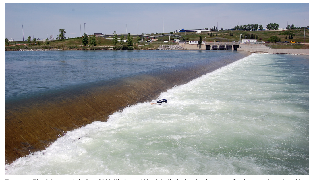
FIGURE 1. The Calgary weir in June 2009 (discharge 109 m<sup>3</sup>/s), displaying the river water flowing over the weir and into the hazardous hydraulic recirculation zone, with trapped sticks and a wheel. The structure on the far side allows offstream diversion into an irrigation canal. This system was subsequently modified with the Harvie Passage to produce safer paddling channels.