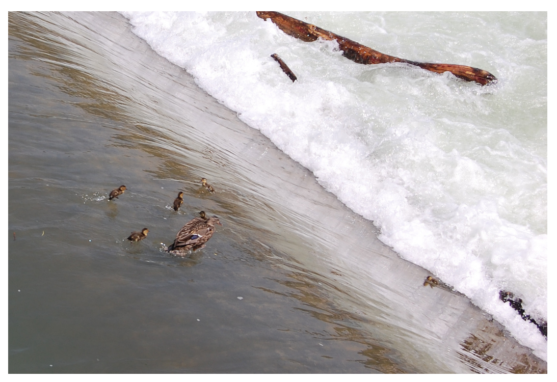
FIGURE 3. A Mallard ( Anas platyrhynchos ) hen with seven ducklings approaching the hydraulic recirculation zone at the Calgary weir, 4 June 2009. Three of these ducklings survived, while four died. The hen is just rising and subsequently flew over the recirculation area.

again plunged under water. With each recirculation, the ducklings appeared to be weakened as they became less vigorous. We observed two ducklings recirculating three times and one four times, but did not observe the fourth over the next few minutes. After about five more minutes, one duckling emerging in the water downstream from the hydraulic recirculation area, drifting passively on its side, apparently dead. We observed no further evidence of the remaining three ducklings over an additional 30 min.