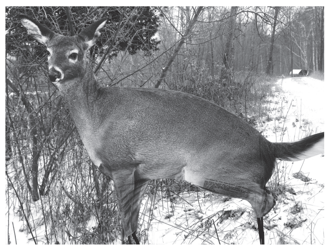
FIGURE 1. Life-like decoy of a White-tailed Deer ( Odocoileus virginianus ) that was attacked by a wolf ( Canis sp.) 2 km west of Killarney Provincial Park, Ontario, Canada, during the first week of November 2017.

water; this channel surrounds McGregor Island. The maple forest that the stand overlooked had minimal understorey for about 150 m before transitioning to marshy lowland, which abutted a small shallow cove that was connected to the main water channel. D.P.G. accessed the stand by parking his boat at the northwestern opening of this cove (~300 m east by northeast of the stand). There was no snow cover during this period.