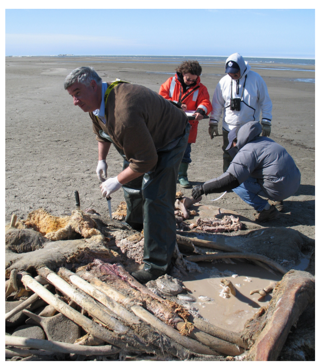
FIGURE 3. Veterinary pathologist, assisted by technical staff from Fisheries and Oceans Canada and the community of Tuktoyaktuk, Northwest Territories, conducting a necropsy of a highly decomposed 'subadult' beachcast Bowhead Whale ( Balaena mysticetus ) carcass, Atkinson Point, Northwest Territories, Canada (no. 16, Figure 2).

known natural cause of death in a stranded Bowhead Whale was attributed to intestinal volvulus (Heidel and Albert 1994), recent detection of harmful algal (HABs) toxins in harvested and stranded marine mammals in Alaska in 2014 suggest this could be a potential contributing factor to future whale morbidity and loss (Lefebvre et al. 2016). As well, detection of an exotic pathogen, phocine distemper virus in Alaskan Sea Otters ( Enhydra lutris ), suggests a possible route of intro-