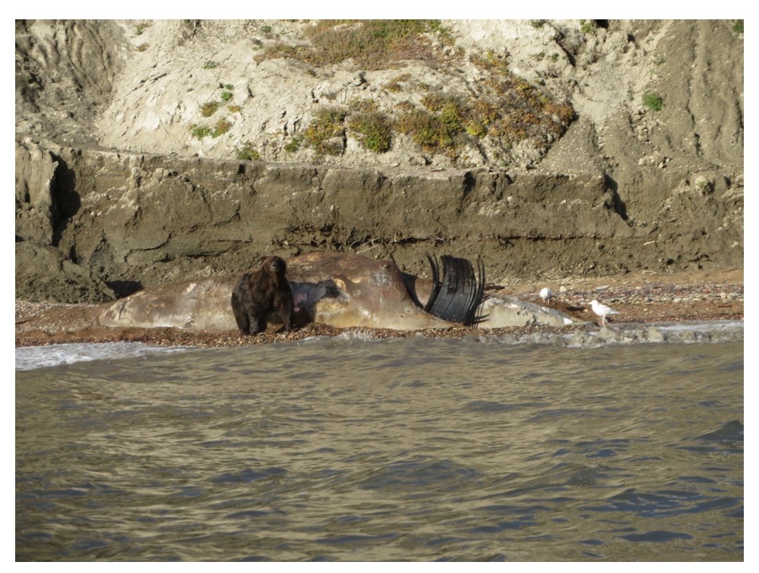
FIGURE 4. Bowhead Whale ( Balaena mysticetus ) 'adult' carcass at Franklin Bay with Grizzly Bear ( Ursus arctos ) scavenging (no. 26, Figure 2).

duction via the Northwest Passage (Goldstein et al. 2009). Exposure of Bowhead Whales to other novel pathogens may also be a consideration.