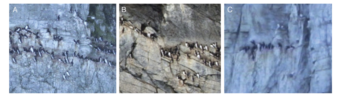
FIGURE 2. Sample photos of Thick-billed Murre ( Uria lomvia ) colonies with assigned quality of, left to right, 1, 2, and 3.

Data on the conversion of counts of individual Blacklegged Kittiwakes to breeding pairs is less extensive than for Thick-billed Murres. We used the ratio during incubation of known breeding pairs (sites where at least one egg was laid) to individuals, counted at one study plot containing 75 active nests on Prince Leopold Island in 2012, where the ratio was 0.56 (A.J.G., unpublished data).