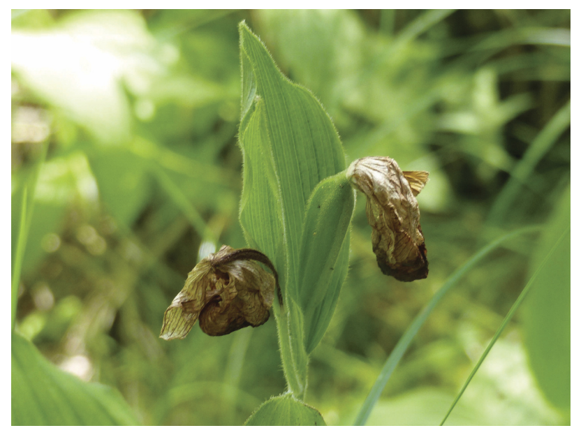
FIGURE 2. Shrivelled Showy Lady's-slipper ( Cypripedium reginae ) flowers, one with developed (right) and one with undeveloped capsule, Purdon Fen, eastern Ontario, 2015.