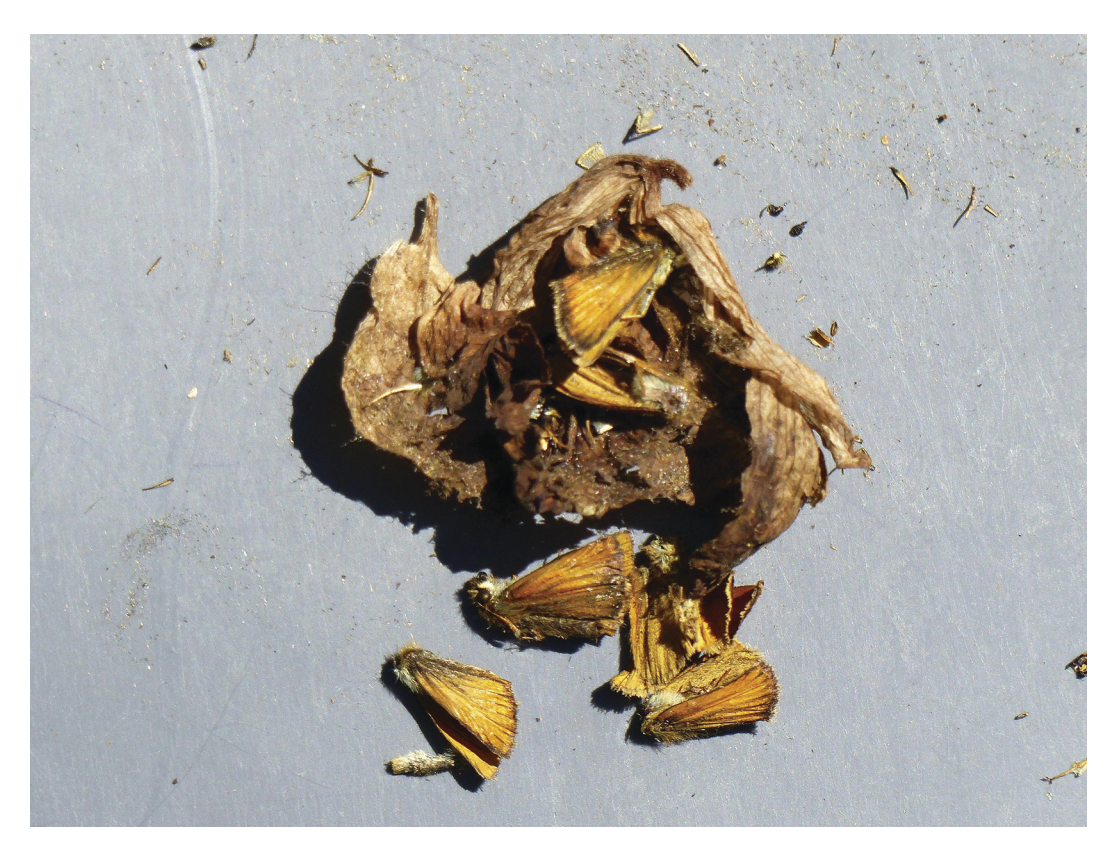
FIGURE 3. Opened shrivelled Showy Lady's-slipper ( Cypripedium reginae ) flower with seven trapped European Skippers ( Thymelicus lineola ), Purdon Fen, eastern Ontario, 2015.