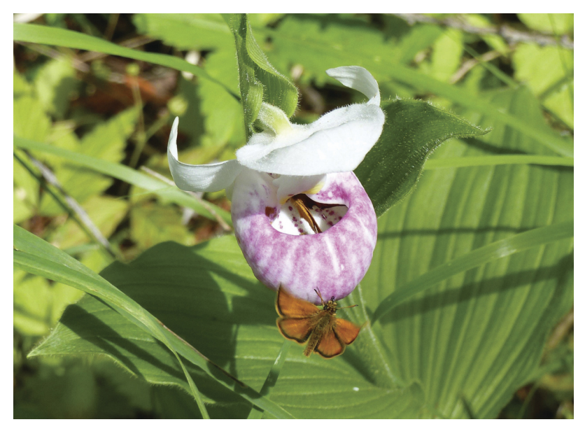
FIGURE 1. Fresh Showy Lady's-slipper ( Cypripedium reginae ) flower with one European Skipper ( Thymelicus lineola ) trapped inside and one trying to enter the flower, Purdon Fen, eastern Ontario, 2015.

3). This we did to test the hypothesis that the presence of any skippers was deleterious, and the more skippers there were in a flower, the greater the likelihood of interference and the lower the likelihood of capsule development.