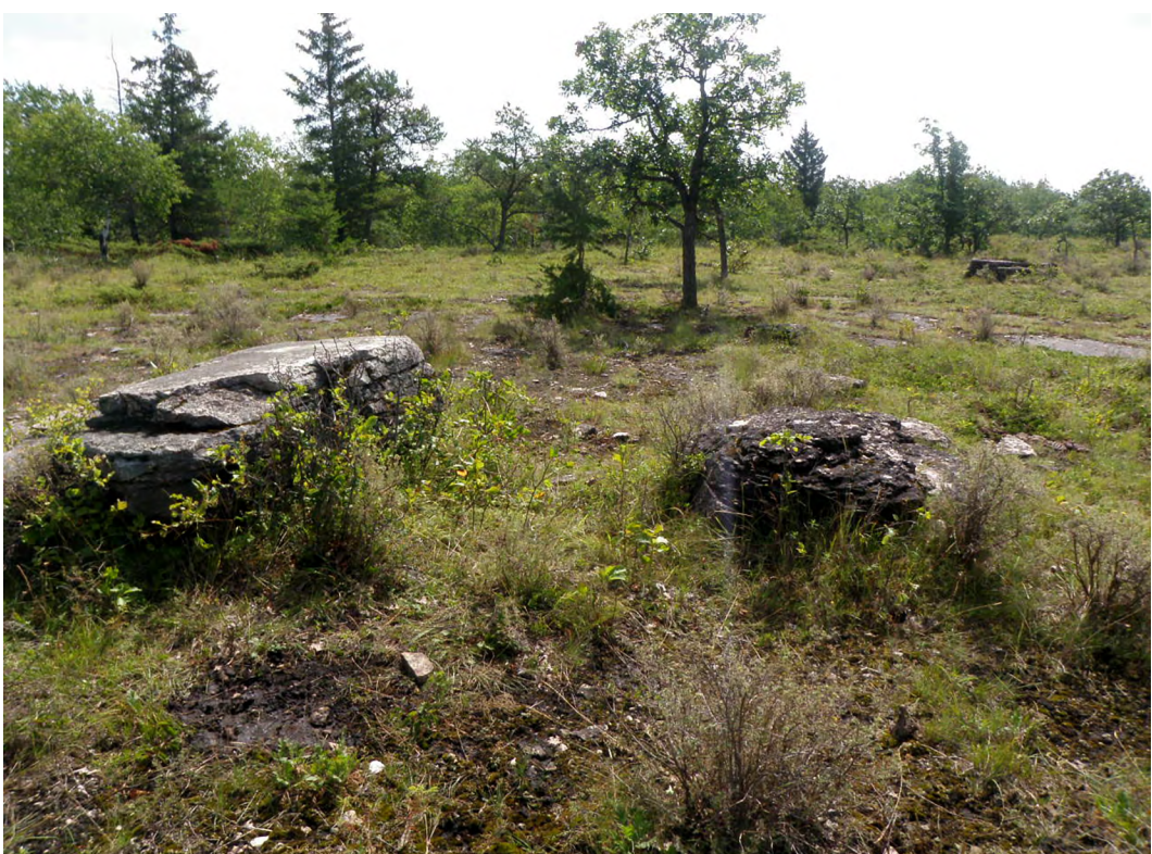
FIGURE 6. Shrubland alvar at the Marble Ridge Alvar site. Some of the scattered boulders support Gastony's Cliffbrake ( Pellaea gastonyi ) or Western Dwarf Cliffbrake ( Pellaea glabella ssp. occidentalis) or both.