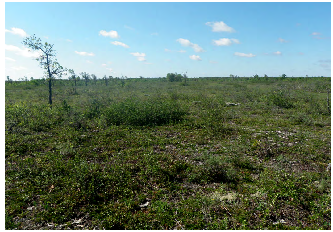
FIGURE 4. Shrubland alvar at the Clematis Alvar site.