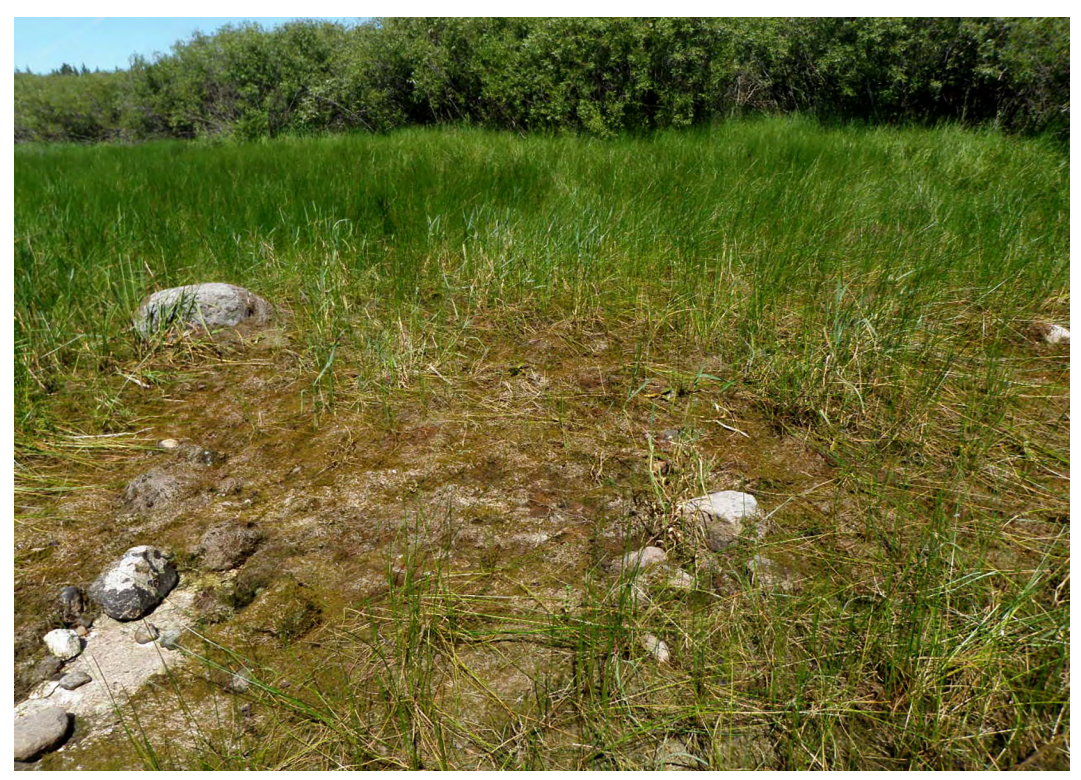
FIGURE 9. Wetland alvar at the Marble Ridge Alvar site.