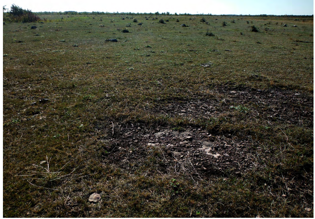
FIGURE 3. Grazed grassland alvar at the Sylvan Alvar site.