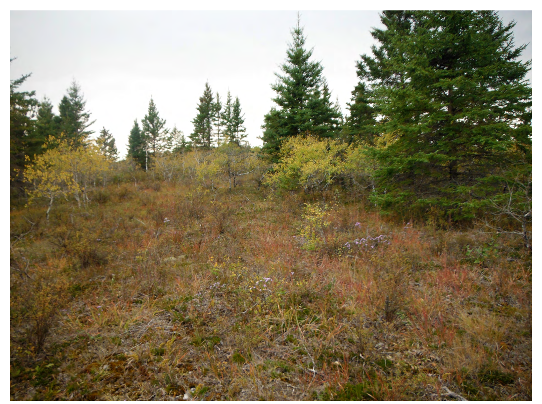
FIGURE 7. Savannah alvar with White Spruce (Picea glauca) at the Poplarfield Alvar site.

Alvars occur on four Ordovician formations. The Marble Ridge Alvar site and the rest of the Poplarfield Alvar sites are primarily located within the western