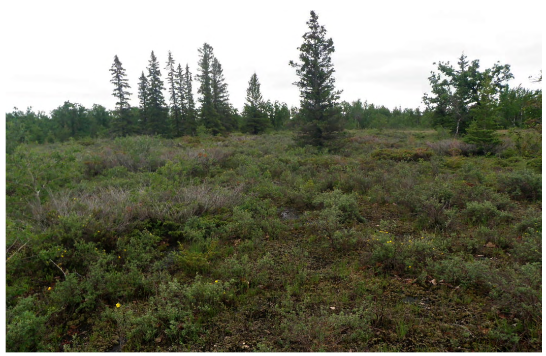
FIGURE 5. At the Clematis Alvar site, trees are often present along the periphery where the alvar transitions into woodland.