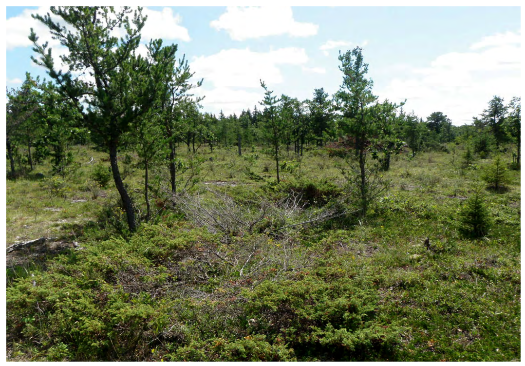
FIGURE 8. Savannah alvar with Jack Pine (Pinus banksiana) at the Marble Ridge Alvar site.