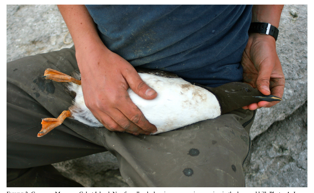
FIGURE 3. Common Murre on Cabot Island, Newfoundland, showing progressive greying in the legs and bill.