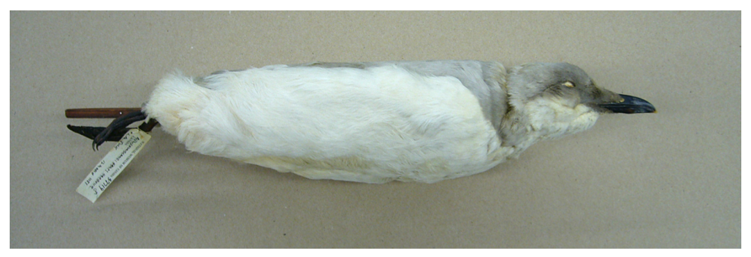
FIGURE 1. Thick-billed Murre (CMNAV 37719) showing dilution.