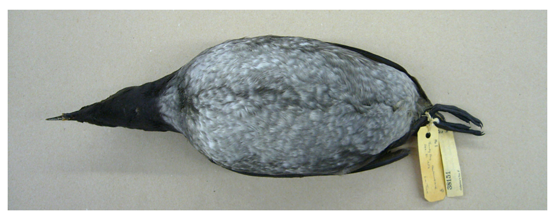
FIGURE 2. Melanistic Thick-billed Murre (CMNAV 38151).