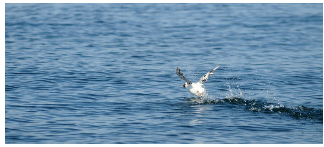
FIGURE 6. A "white puffin" in the Grand Manan basin, New Brunswick, in 2009, showing an extreme case of progressive greying.

In 2002, 2004, and 2009, a "white puffin" was observed at sea around Machias Seal Island or in the Grand Manan basin (Figure 6). The bare parts were unaffected, as were portions of the feathers (e.g., tips of primary feathers), making this an extreme case of progressive greying. Other "white puffins" have been recorded at the Isles of Scilly, United Kingdom, in May 2009 (Harris and Wanless 2011) and at the Faroe Islands in the late 1800s (Lockley 1953; see below).