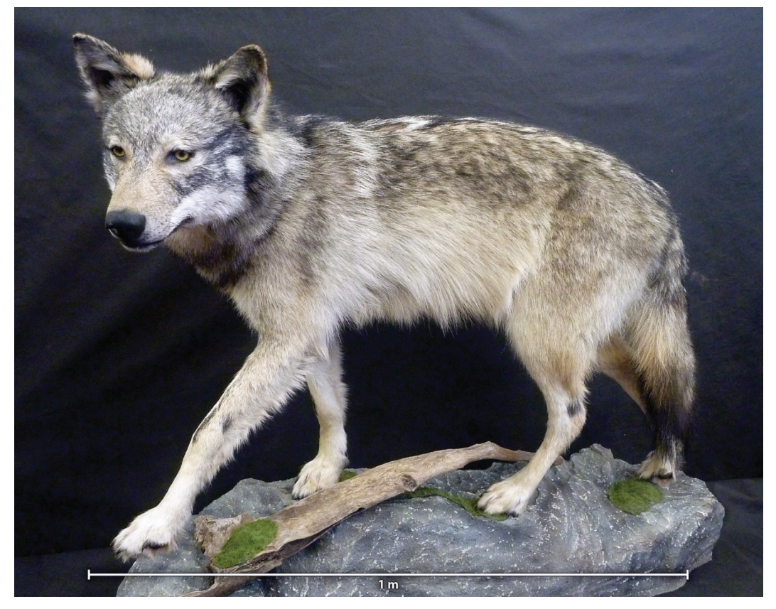
FIGURE 3. Taxidermied skin of the Caraquet wolf, a Gray–Eastern Wolf hybrid ( Canis lupus × C. lycaon ) (NBM M11985).

The Caraquet wolf (Figure 3) was a male; testes were scrotal and measured 40.6 mm by 29.1 mm. Shortly after death, the animal weighed 39.9 kg. Tooth wear suggests that it was 3–4 years old at time of death. Measurements for the animal were as follows: total length 1573 mm, tail vertebrae 397 mm, hind foot 278 mm, ear 107.4 mm. Physically, the animal was in good body condition; it was negative for mange and carried 12.2–22.6 mm of extra-visceral body fat across the lateral pelvic region, about 2 mm over the ribs, and 819.2 g of visceral fat. Stomach contents (266.4 g wet