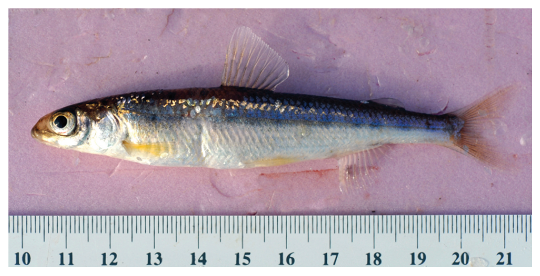
FIGURE 2. Pygmy Whitefish (Prosopium coulterii) captured in Bluefish Lake, Northwest Territories, 2012.

ed light at a magnification between 10 \times \text{ and } 30 \times . All rakers were counted, including rudimentary rakers at the base of the arch. Scales in the lateral line were enumerated to the end of the hypural complex; where scales were missing because of damage during handling, scale pockets were counted. For fin ray enumeration, the anterior rays were excluded unless they were at least two-thirds the length of the longest ray. When