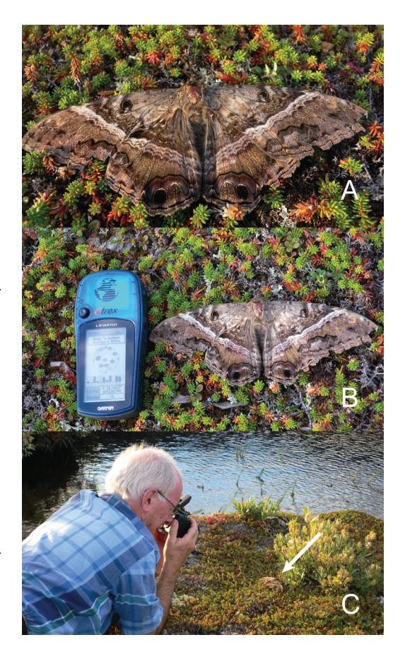
FIGURE 2. The presence of Ascalapha odorata (Black Witch) near Churchill, Manitoba. A and B: The worn but living specimen collected near Bird Cove, 18 km east of Churchill, Manitoba, on 18 August 2006. C: Paul Hebert documents the most exciting catch of the day.

The Churchill specimen is the first individual of A. odorata found in the Low Arctic tundra. This individual probably arrived in the Hudson Bay area on strong southerly winds about a week before its discovery (P. Kevan, personal observation). The specimen is now housed in the Biodiversity Institute of Ontario at the University of Guelph, and its photograph is accessible on the Barcode of Life Data Systems (Ratnasingham and Hebert 2007): http://www.boldsystems.org/index.php/Public_RecordView?processid=DSCNI024-07.