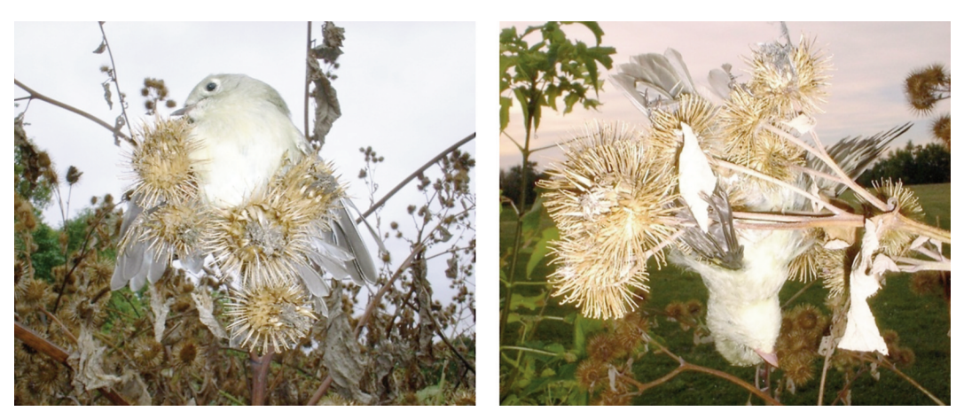
FIGURE 1. Birds found entangled in burdock ( Arctium spp.) burrs in Winnipeg, Manitoba: Ruby-crowned Kinglet ( Regulus calendula ) (left) found alive on 21 September 2001 and Yellow-bellied Flycatcher ( Empidonax flaviventris ) found dead on 13 September 2001.

used a Kruskal-Wallis test to analyze the timing of entanglements.