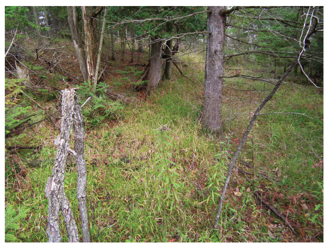
FIGURE 3. Brachypodium sylvaticum (Slender False Brome) population in Grey County, Ontario, 18 October 2011. The graminoid vegetation in the foreground and right side of the photo is almost entirely Brachypodium sylvaticum.

In the flora of Ontario, Brachypodium sylvaticum most closely resembles species in the genus Bromus , particularly Bromus pubescens (Hairy Woodland Brome), due to its hairy leaves and spikelets. However, Brachypodium can be distinguished from Bromus by its open leaf sheaths (closed in Bromus ) and spikelets arising singly from the rachis on short pedicels (branched inflorescences in Bromus ). The only other Brachypodium species in eastern North America, Brachypodium pinnatum (Heath False Brome), is rare in disturbed ground and waste areas in Massachusetts (Haines 2011). It can be distinguished from Brachypodium sylvaticum by its rhizomes, usually hairless culms and leaf sheaths, stiffer racemes, and short or absent lemma awns (Piep 2007; Paszco 2008).