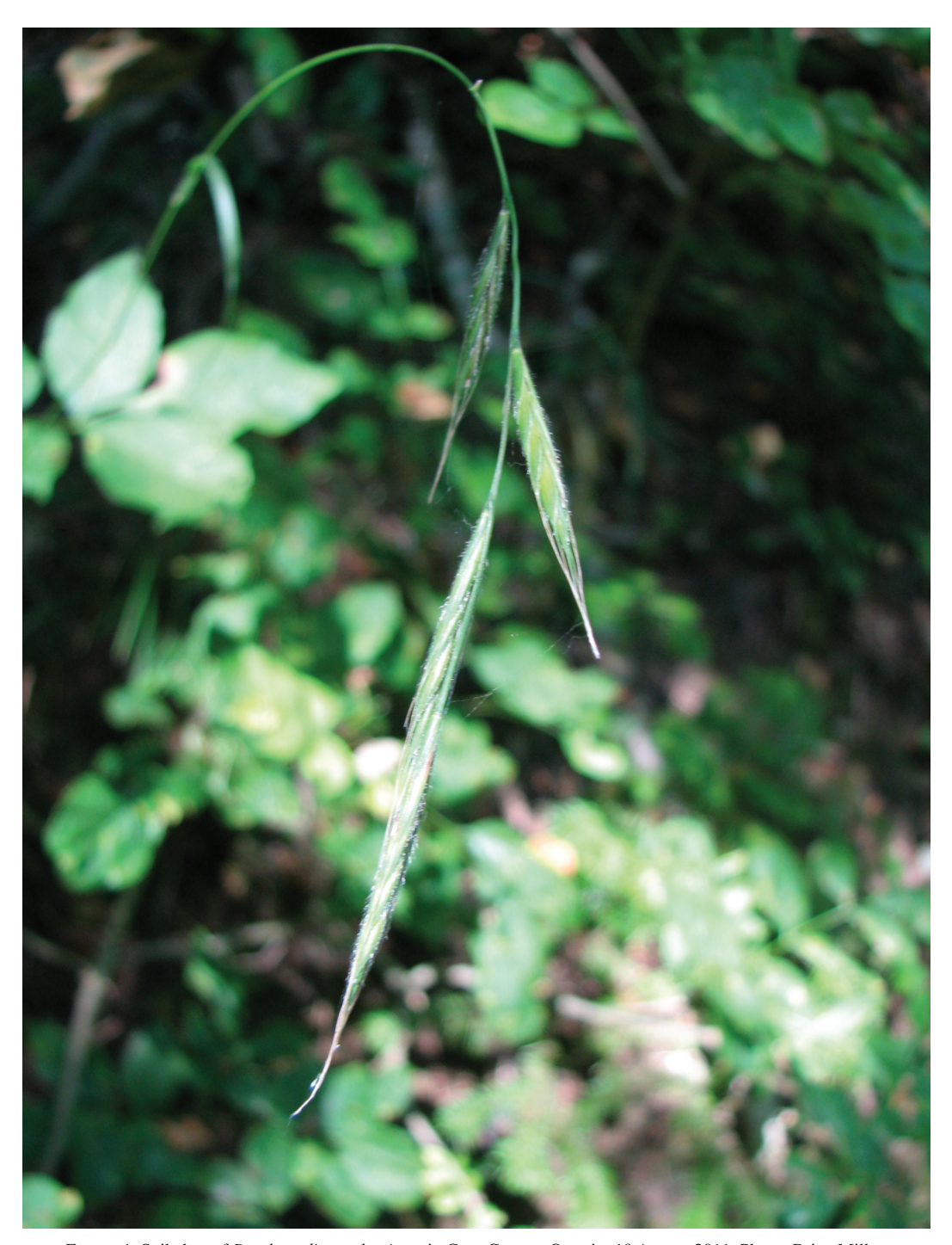
FIGURE\ 1.\ Spikelets\ of\ \textit{Brachypodium\ sylvaticum\ } in\ Grey\ County,\ Ontario,\ 19\ August\ 2011.\ Photo:\ Brian\ Miller.