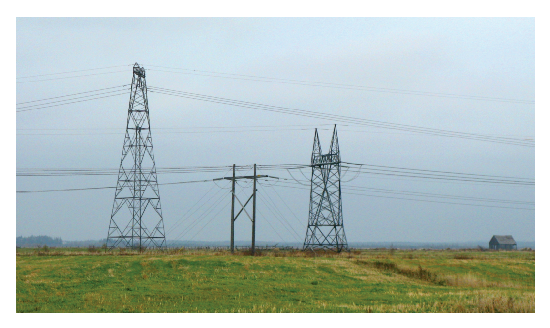
FIGURE 4. Intersection of three transmission lines north of the covered bridge on the High Marsh Road (Jolicure Road), Tantramar Marsh, New Brunswick, the site of numerous Common Eider collisions.

the ground away from open water, it may be difficult for it to regain flight. Furthermore, once grounded, these birds make easy prey for a variety of predators and often, based on the numbers of predated carcasses we observed, have little chance of survival.