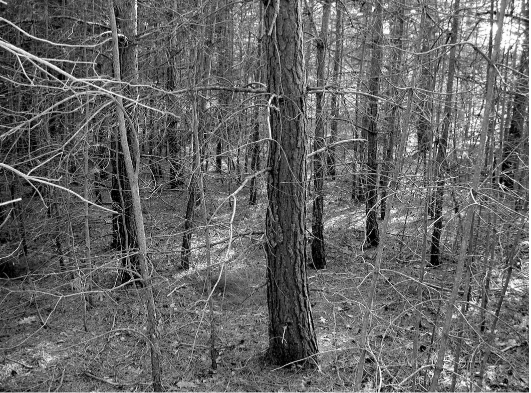
FIGURE 5 Dense stand of Scots Pine ( Pinus sylvestris ) with ground covered mostly by pine litter on the west side of Auburn (approximately 45.0166° N, 64.8833° W).

remnants of this ecosystem provide pollinators for adjacent fruit crops and contain distinctive variants of native crop relatives that could be valuable in crop improvement and diversification (see above and Catling et al. 2004). Thus they are sources of valuable biodiversity. The perpetuation of this important ecosystem will require not only a system of protected sites but also management of succession and invasive aliens, particularly Scots Pine.