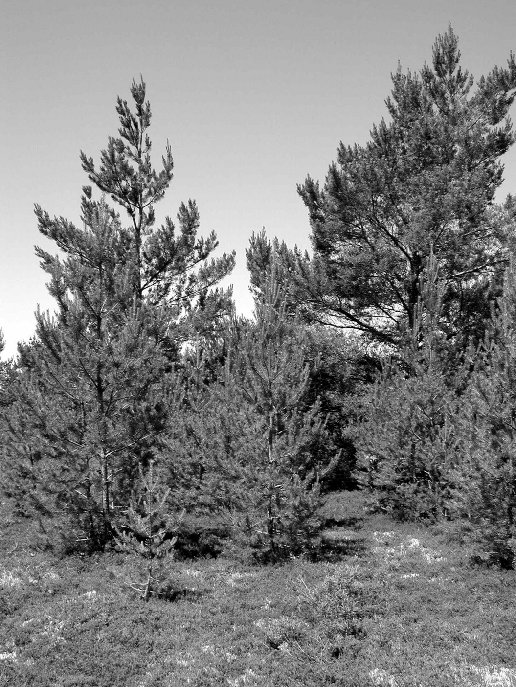
FIGURE 4. Scots Pine ( Pinus sylvestris ) of many different age classes invading open heathland dominated by Corema ( Corema conradii ) on the west side of Auburn (approximately 45.0083° N, 64.8916° W).