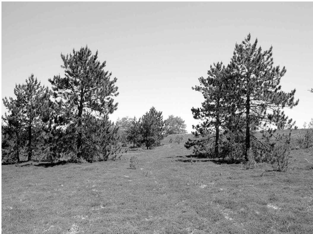
FIGURE 2. Natural heathland on the west side of Auburn (approximately 45.0166° N, 64.8833° W) with ground cover dominated by Corema ( Corema conradii ) and scattered native Red Pine ( Pinus resinosa ).

provided a maximally accurate description of biomass. Species up to 2 m tall (including trees) were recorded. In a very few cases where a large tree trunk was in a selected quadrat, the position of the quadrat was moved (up to ½ m) to avoid the trunk. For comparison, the mean frequencies and covers for each pair of communities was calculated and expressed as a percentage of that of the open heath. Voucher specimens are in the collection of Agriculture and Agri-Food Canada in Ottawa (acronym DAO).