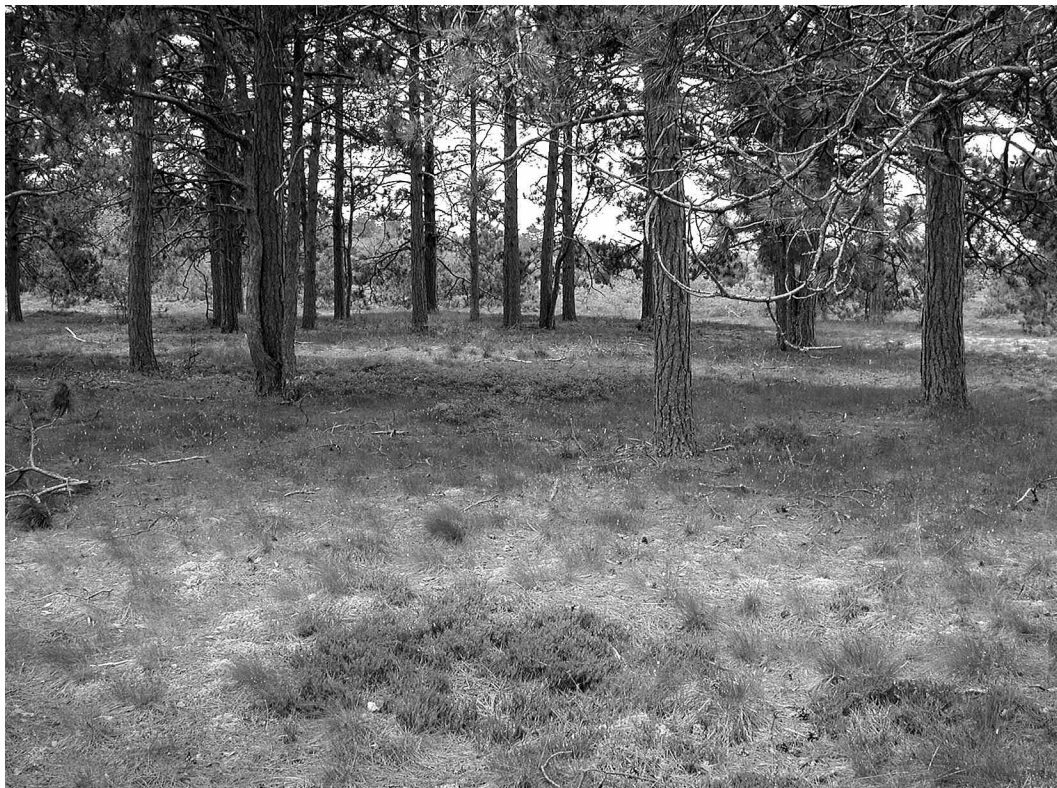
FIGURE 3. Open Red Pine stand northwest of Kingston (approximately 44.9916° N, 64.9750° W) with heath vegetation dominated by blueberry ( Vaccinium angustifolium ).

open heathland very slowly or not at all, whereas the European Scots Pine is an aggressive invader that forms dense stands. These not only reduce the biodiversity of native vascular plant species, but they also eliminate the native open heathland ecosystem. Management of Scots Pine will be necessary to protect representative sites.