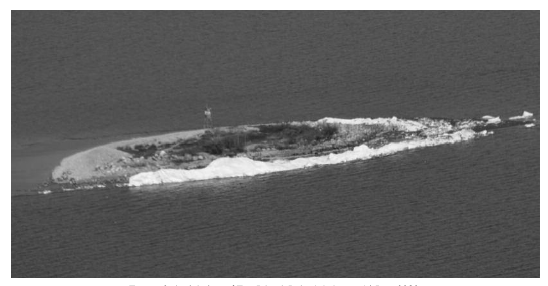
FIGURE 2. Aerial view of Egg Island, Lake Athabasca, 14 June 2009.

Volume (cm<sup>3</sup>) = 0.489 (length × breadth<sup>2</sup>)/1000 (Ryder 1975)