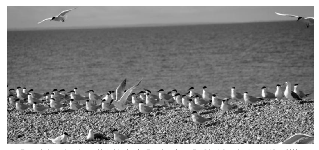
FIGURE 3. Approximately one-third of the Caspian Terns breeding on Egg Island, Lake Athabasca, 14 June 2009.

In addition, there were 87 California Gull nests and 3 Herring Gull nests. Clutch size distribution data were also collected and are shown in Table 1. Average clutch size for Caspian Terns breeding in northern North America is three eggs (Bent 1921). Similarly, modal