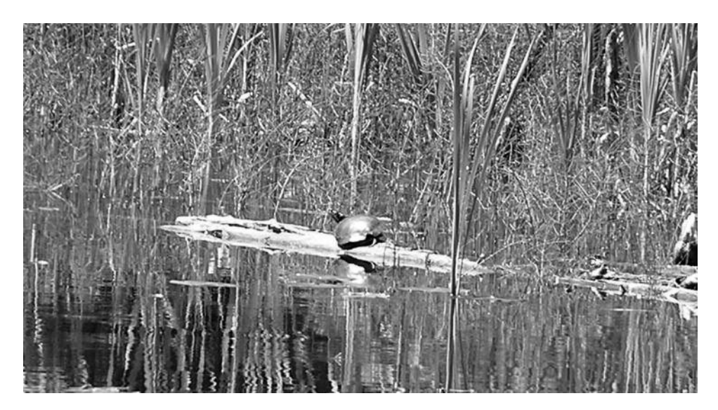
FIGURE 2. Basking Midland Painted Turtle, unnamed pond 2.2 km south-southeast of Cobalt, 17 June 2010. W. F. Weller (Royal Ontario Museum, photographic voucher, dm00269).

southeast of the town of Latchford (47.26811°N, 79.77426°W). 29 May 2008. W. F. Weller. ROM (photographic voucher) 46450. Five adults observed basking on grassy shoreline of a small lake at 0910 h. NIPISSING DISTRICT, Strathy Township, 1.3 km north of the town of Temagami (47.07832°N, 79.79232°W). 29 May 2008. W. F. Weller. ROM (photographic voucher) 46451. Three adults observed basking on two logs in pond at 1005 h.