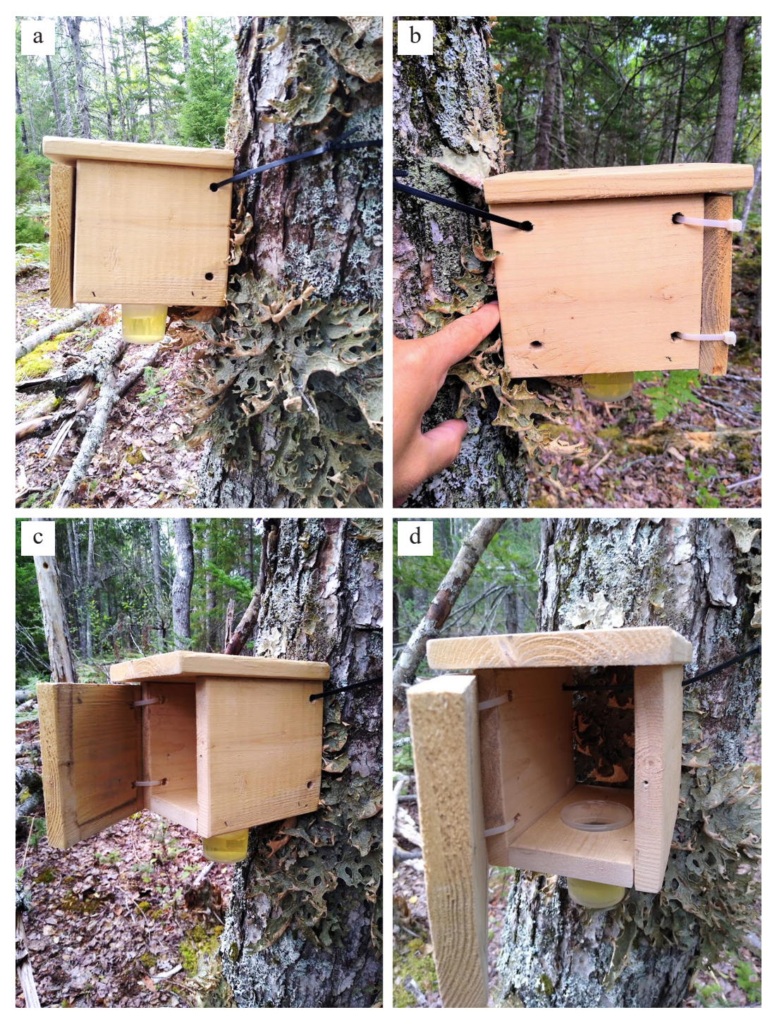
FIGURE 2. A tree trap used to collect slugs on lichen trees in southwest Nova Scotia. A plastic jar baited with beer was placed in the bottom of the trap. The inner side of the box was open, against the tree trunk. The outer side of the box served as a door to retrieve collected slugs and to rebait the traps.