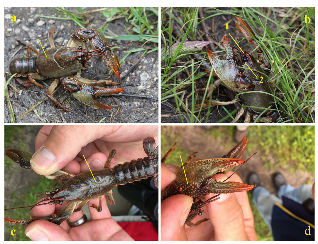
FIGURE 1. Paintedhand Mudbug ( Lacunicambarus polychromatus ) recorded on 26 May 2017 at Ojibway Prairie Provincial Nature Reserve, Windsor, Ontario. Distinguishing characteristics of the species are indicated by lines: closed areola (a, c); deflected rostrum (b1); suborbital angle (b2); dorsal surface of the palm of the chela with mesial quarter to third studded with tubercles not forming distinct rows (d).

The surveys on 15 May 2018 at Ojibway Prairie Provincial Nature Reserve were successful in confirming the presence of L. polychromatus . At this location, burrows were found along a shallow ditch running along the northern edge of the nature reserve not far from where the specimen was located in 2017. The nature reserve is 105 ha in size and includes a