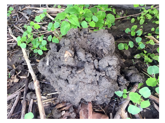
FIGURE 3. Fresh mud at the opening of a crayfish burrow in Vince Marcotte Park, Windsor, Ontario, Canada (42.245°N, 83.071°W), 15 May 2018.

As species, such as Paintedhand Mudbug, are new-