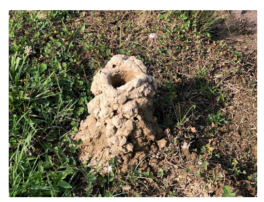
FIGURE 4. A Paintedhand Mudbug ( Lacunicambarus poly-chromatus ) chimney in Muhlenberg County, Kentucky, USA (37.313°N, 87.201°W), 11 June 2018.

ly discovered in Ontario, they are added to the provincial species list maintained by the Natural Heritage Information Centre (NHIC), Ontario Ministry of Natural Resources and Forestry, and are assigned a conservation status rank following methods developed by NatureServe (Faber-Langendoen et al. 2012; Master et al. 2012). Paintedhand Mudbug has been assigned a rank of S1S2 (critically imperilled to imperilled). The NHIC typically compiles observations of species with a conservation status rank of S3 (vulnerable) or higher. These observations then inform areas of conservation value (element occurrences) and are added to the provincial record where they are available to inform conservation, land-use, and natural resources management planning, policy, and legislation.