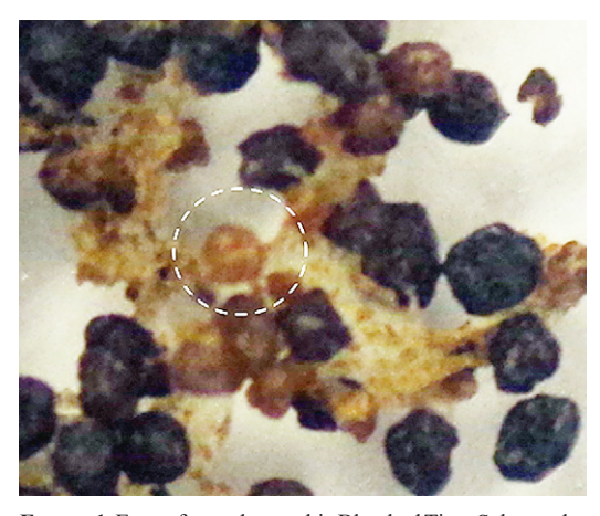
FIGURE 1. Eggs of a paedomorphic Blotched Tiger Salamander ( Ambystoma mavortium melanostictum ) from near Oliver, British Columbia, Canada, observed through a stereomicroscope (16×). Eggs were either smaller, pale, immature (white circle) or larger, dark, mature.

The 176 adult specimens collected were female biased, with a ratio of 1.4 females to every male, assuming sexing was accurate. From the more closely