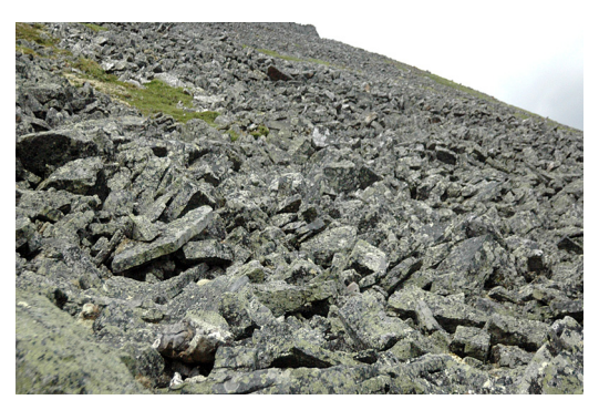
FIGURE 2. Photograph of site 8 (see Table 2)—an example of the site characteristics where Collared Pika ( Ochotona collaris ) were observed in northern Yukon, Canada.

sites surveyed on the ground (Table 2; Figure 1). One of these sites was just outside the northern boundary of Tombstone Territorial Park, where Collared Pika are already known and monitored (Kukka et al. 2014; Figure 1). We detected Collared Pika at three of five and one of seven sites surveyed in the northern and southern Richardson Mountains, respectively, and four of eight sites in the Nahoni Mountains (Figure 1). At two sites (sites 4 [Figure 3a] and 11; Table 2) we detected only old sign of Collared Pika, indicating that the population may have been extirpated. This included the single site where we detected Collared Pika in the southern Richardson Mountains (site 4, Table 2). Although our survey was not designed to estimate the density of Collared Pika at our sites, it appeared that they persisted at low densities at all the sites where they were detected. In only one instance did we detect more than a single individual at a site. In suitable habitat in southwestern Yukon, Collared Pika density is estimated at <1 to 4 individuals per ha (Morrison and Hik 2007).