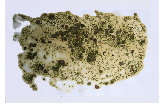
FIGURE 4. Sample of dried, glue-impregnated Columbia Duckmeal ( Wolffia columbiana ); larger intermixed plants are Spirodella polyrhiza (L.) Schleiden. 25 August 2017, Renfrew, Renfrew County, Ontario, D.F. Brunton & K. Fleming 19,783.

Applying this voucher preparation technique to over 30 samples of native Ontario Wolffia involving