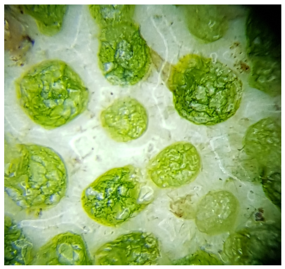
FIGURE 5. Close-up of glue-impregnated Columbia Duckmeal ( Wolffia columbiana ) retaining shape and size. 25 August 2017, Renfrew, Renfrew County, Ontario, D.F. Brunton & K. Fleming 19,783.

pondweed ( Potamogeton and Stuckenia ) plants in a more natural form. As currently understood, however, this technique provides a logistically simple, spaceefficient, permanent preservation alternative for making Wolffia vouchers, for which there is an immediate need. The technique has the added benefit of being hazard free for the preparator and posing no curatorial risks to associated herbarium material.