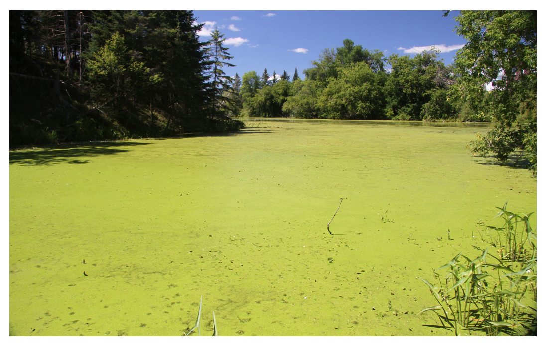
FIGURE 1. Dense duckmeal ( Wolffia spp.) mat completely covering creek surface. 8 August 2011, Beachburg, Renfrew County, Ontario.