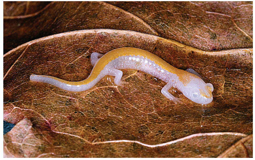
FIGURE 3. Dorsal-lateral view of a variant of the amelanistic condition of the Eastern Red-backed Salamander, Plethodon cinereus , from Point Pleasant Park, Halifax, Nova Scotia.