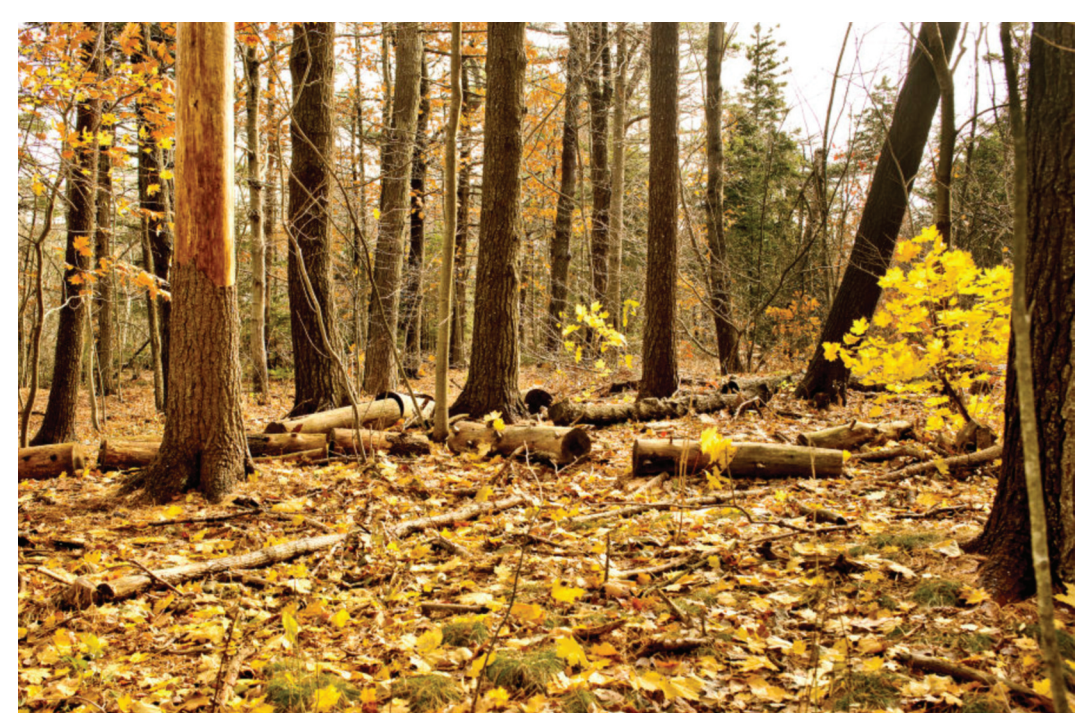
FIGURE 2. Habitat where a variant of the amelanistic condition of the Eastern Red-backed Salamander, Plethodon cinereus , was discovered in Point Pleasant Park, Halifax, Nova Scotia.