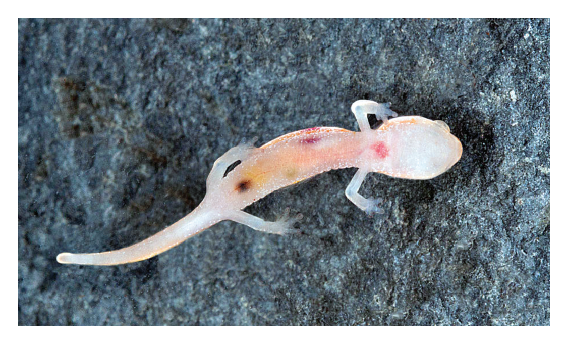
FIGURE 4. Ventral view of a variant of the amelanistic condition of the Eastern Red-backed Salamander, Plethodon cinereus , from Point Pleasant Park, Halifax, Nova Scotia.

in a small, isolated population. This could also be a chance observation of a rare event.