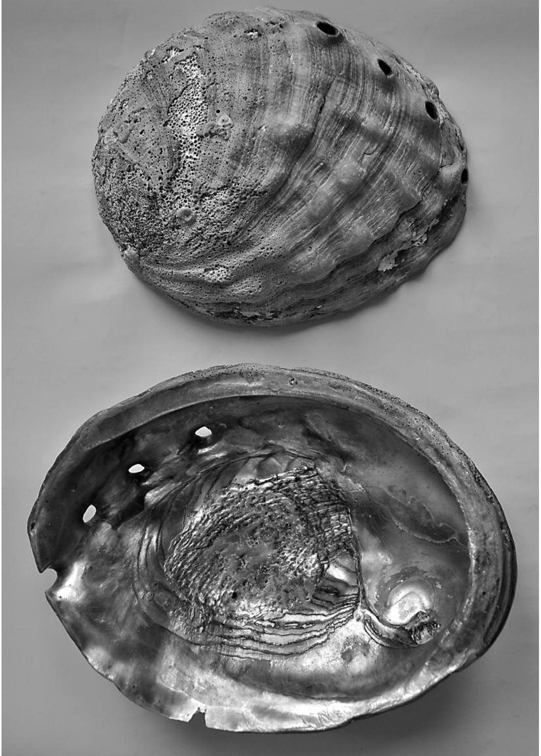
FIGURE 2. Two beached Red Abalone shells collected from Haida Gwaii, British Columbia. The top shell is from Gowgaia Bay (shell length 200 mm) and the bottom shell is from Louscoone Inlet (shell length 235 mm).