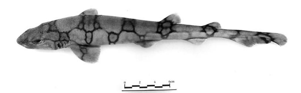
FIGURE 2. An adult female Chain Dogfish, Scyliorhinus retifer , second record for the Canadian Atlantic, captured at the southern outer edge of Big LaHave Bank, Nova Scotia, 10 May 2001, by David A. D'Eon (Nova Scotia Museum of Natural History Negative Number N-25,642).

Measurements after Springer (1979) for the two specimens are as follows in percentages of total length: tip of snout to front of mouth 4.8-4.9; to eye 6.4-6.7; to first gill slit 15.4-15.5; to fifth gill slit 19.0-19.9; to origin of pectoral fin 18.3-19.6; to origin of first dorsal fin 51.5-52.5; to origin of pelvic fin 43.2-44.6; to second dorsal fin 67.0-69.0; to anal fin 61.5-63.1; to origin of upper caudal fin lobe 77.5-78.7; to anterior end of cloacal opening 45.3-47.2. Orbit diameter 3.8-3.9 and orbit height 0.9-1.0. Least distance between nasal apertures 1.7. Mouth width 8.0-8.2 and mouth length 4.0-5.0. Length lower labial furrow 1.4. Height of first gill slit 1.8-2.0 and height of fifth gill slit 0.7-1.1. First dorsal fin base length 6.0-6.7 and anterior margin length 9.9. Second dorsal fin base length 4.9-5.6 and anterior margin length 7.3-7.7. Anal fin base length 6.5-7.6 and anterior margin length 7.4-7.6. Length outer margin of pectoral fin 13.2-14.1. Distance between first and second dorsal fin bases 10.4-11.1.