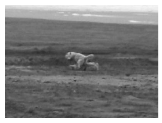
FIGURE 5. A dominant, breeding male wolf rides up on a subordinate on Ellesmere Island, Nunavut, Canada during July 2009.