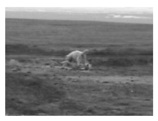
FIGURE 2. A dominant, breeding male wolf pins a subordinate on Ellesmere Island, Nunavut, Canada during July 2009.