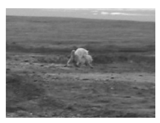
FIGURE 4. A dominant, breeding male wolf straddles a subordinate on Ellesmere Island, Nunavut, Canada during July 2009.