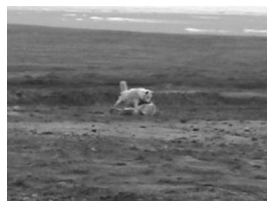
FIGURE 6. A dominant breeding male wolf forces a subordinate wolf down on Ellesmere Island, Nunavut, Canada during July 2009.

was merely a continuation of his normal behavior, not a consequence of the drugging. However, even if the behavior had been affected by the drugging, this observation still is of interest, for no one has reported such prolonged dominating under any circumstance.