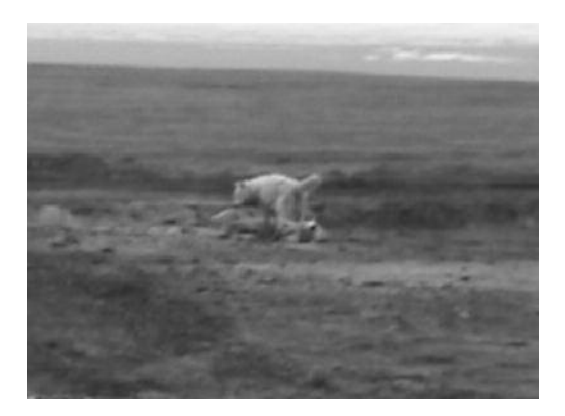
FIGURE 1. A dominant, breeding male wolf stands over a subordinate on Ellesmere Island, Nunavut, Canada during July 2009.

All of our observations of this dominating behavior by the radioed wolf were made after we had drugged and radio-tagged him. Conceivably the length, persistence, and intensity of the behavior could be related to our handling him. However, when we first observed this wolf before darting him he was dominating one of his packmates intensively. We only observed this for about 10 seconds, for our approach interrupted that activity. However we believe that that incident is strong evidence that the observation we report here